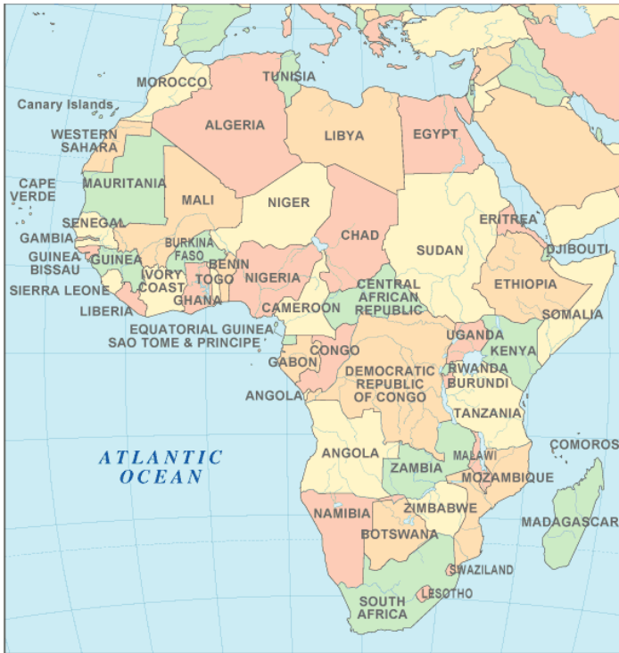
FIGURE 1: Political Map of Africa 10