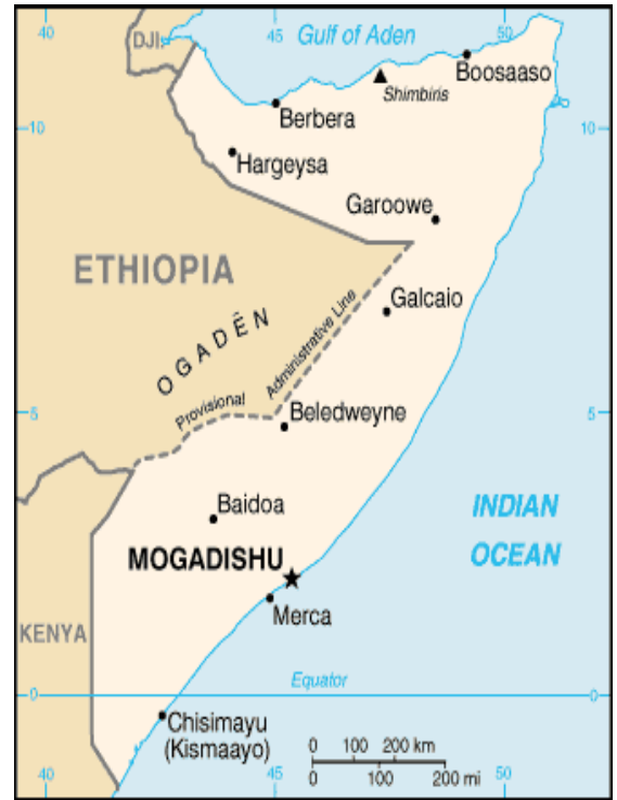
FIGURE 2: Map of Somalia and Neighboring Countries 11

The British and Italians had different strategies and interests in Somalia. Britain was interested in Northern Somalia, mainly as source of livestock for its colony in Aden, 12 its principal supply route to Indian Ocean through the Suez Canal. British occupied Aden in 1839. Italians, on the other hand, wanted crops in the form of plantation agriculture: bananas, sugarcane, and citrus fruits. As soon as the British colonial government started asserting its authority over Somalia at the turn of the century, resistance took shape under the leadership of Somali nationalist Sayyid Mohammed Abdille Hasan: known to the British as “the Mad Mullah”. 13 His Islamic resistance movement sought to end European